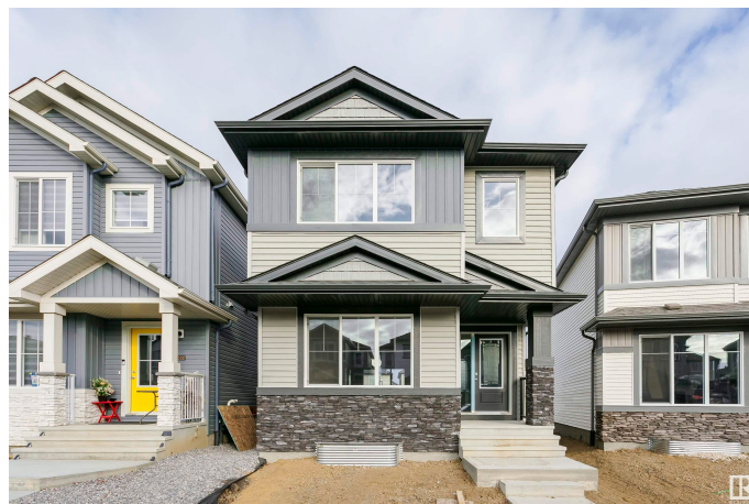
9530 Carson Bend SW, Edmonton, AB

Main Floor Exterior Area 74.32 m 2 Interior Area 68.37 m 2