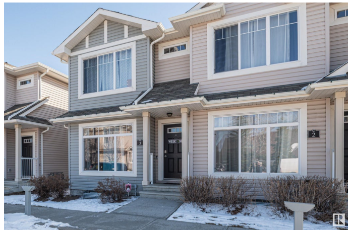
3-6032 38 Ave NW, Edmonton, AB

Main Floor Exterior Area 487.63 sq ft Interior Area 437.16 sq ft